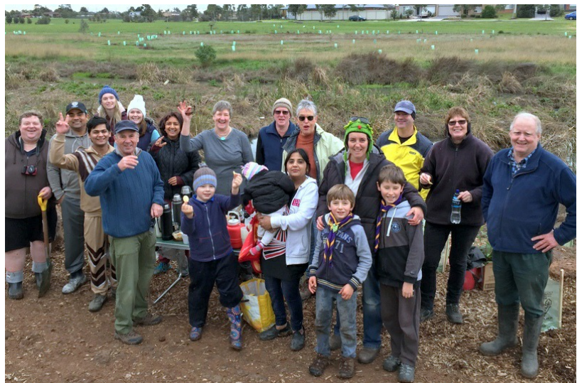
We had a good turn out for our Bromage Close activity on Sunday 26 th June with 25 attending, and finishing just on time for afternoon tea.